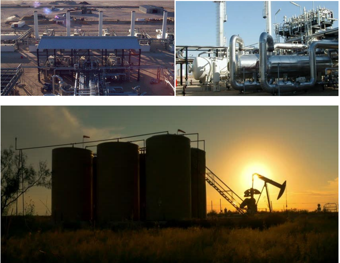
Figure 2 Three Examples of power plants, gas production and oil production facilities of the EnerCam team.